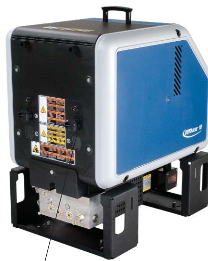
Quick plug-in hose/gun pairs